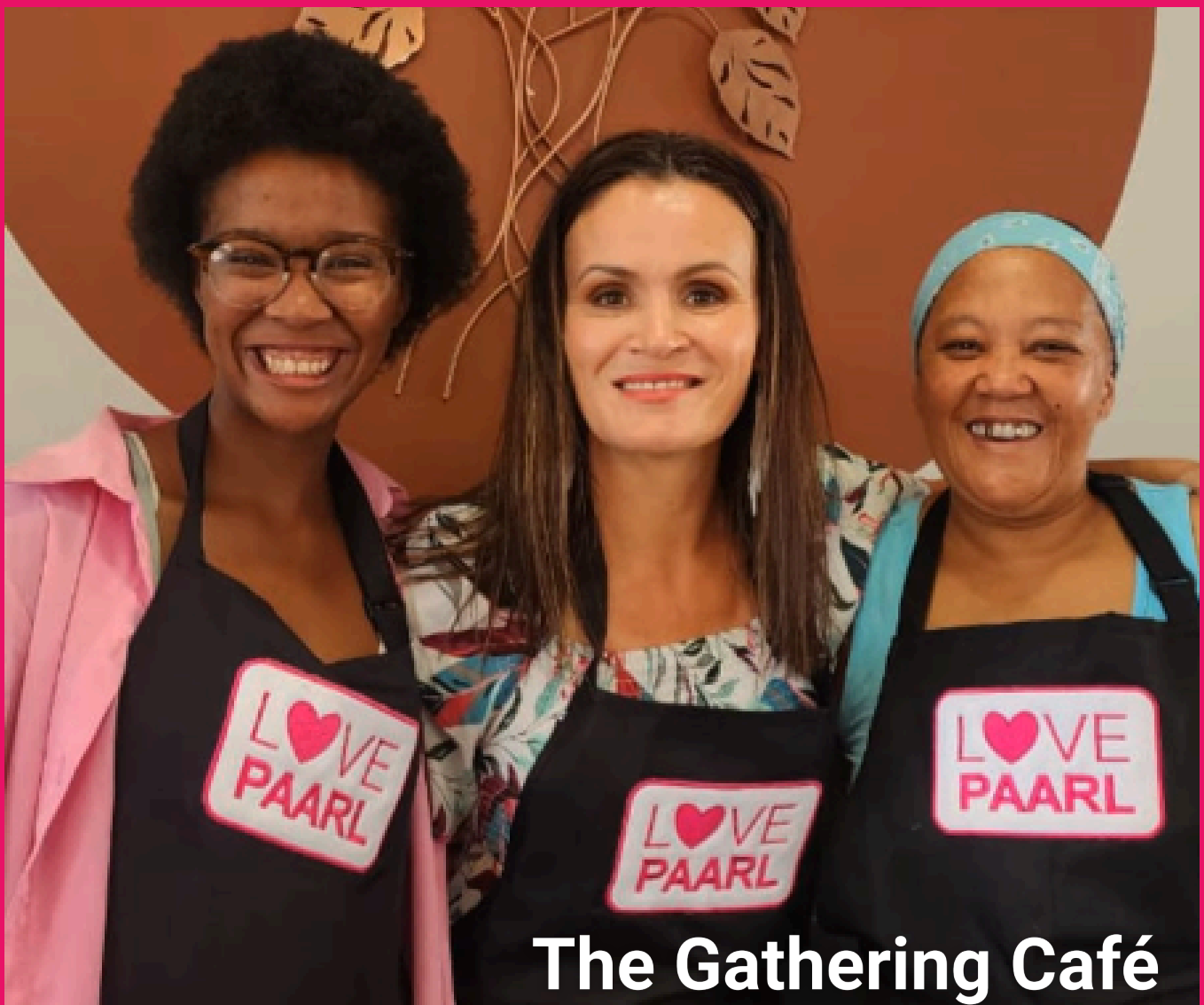
The Gathering Café

Situated on a picturesque church campus in Paarl's New Orleans area, The Gathering Café unites community and commerce through sustainable practices. The café serves three core purposes: generating income to fund Love Paarl's initiatives, acting as a networking hub for local entrepreneurs, and providing an event space for gatherings. It has created jobs, including a dedicated manager role, with rental costs waived via in-kind support until profitability. Rapidly gaining popularity, the café fosters collaboration, celebration, and stronger community bonds in Paarl.